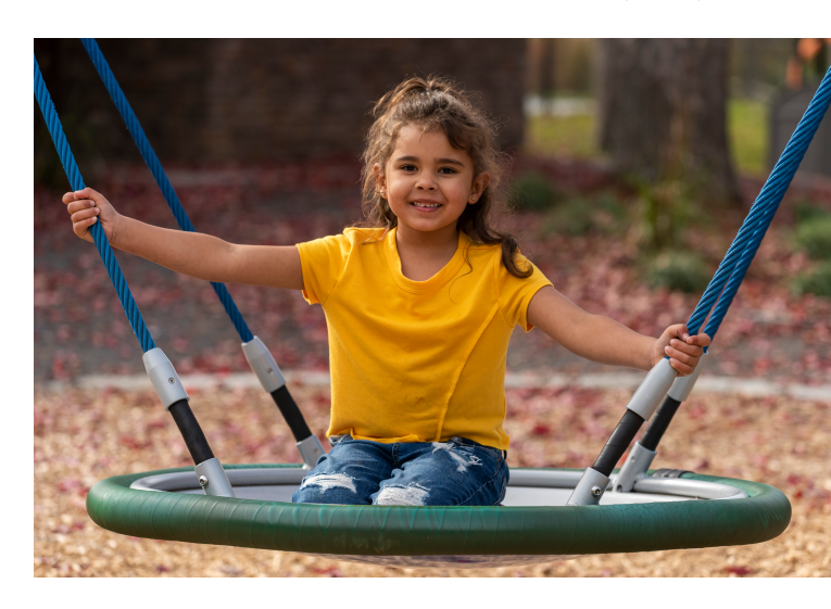
Mental (Health Foundation

The Mental Health Foundation of N.S. recognized the need for funds to support young people who were having trouble connecting socially during the pandemic. The funding received supported the "Getting Youth Socialized" initiative where a number of Big Bunch groups were delivered throughout Pictou County